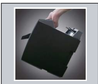
Unique Hand-held design, with more flexibility of movement