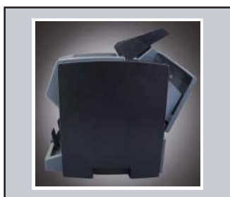
Compact design with easy access to bill path for jam removal and daily maintenance