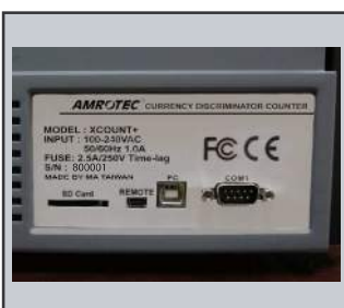
Various I/O ports for PC connectivity, SD card, Printer & Remote display.